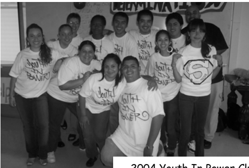
2004 Youth In Power Club from Manual Arts High School

The main component of the Young Worker Project is the YWLA, a three-day conference for teams of teens and their adult sponsors. Teens learn about work place health and safety; are introduced to education, policy, and media strategies; and begin planning a school or community outreach project.